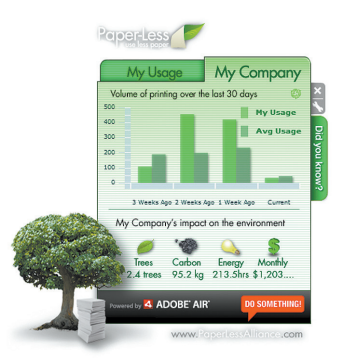
See environmental impact at a glance with the Paper-Less Alliance widget

Advanced scripting can be used to define and finely tune your printing policy and support your organization in eliminating waste and changing user behavior. With PaperCut you can: