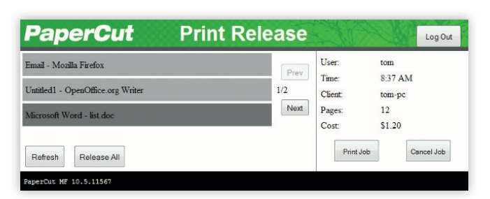
End users can view and manage held print jobs at the MFD